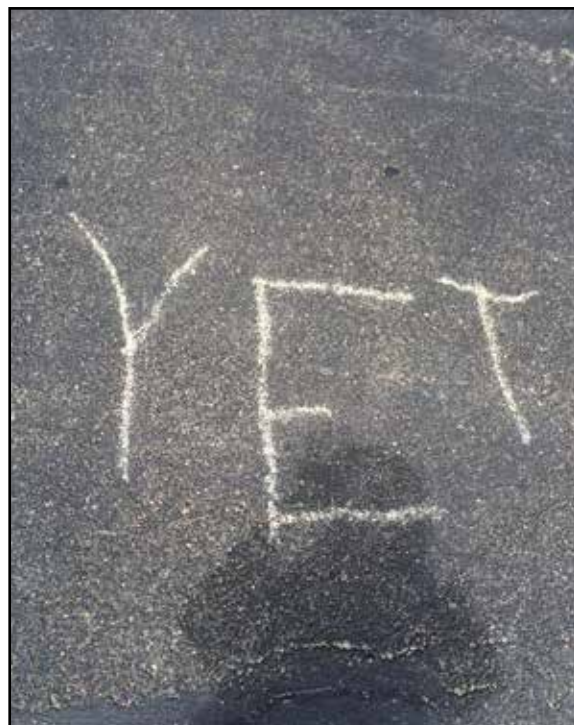
The Power of Yet - We found this on our playground blacktop. Apparently, one or some of our youngest learners were practicing writing their favorite word. If you would like to learn why "yet" is our favorite word here at East View visit this website: http://www.edutopia.org/discussion/power-yet . You can also search on You Tube for a great song called, "The Power of Yet."