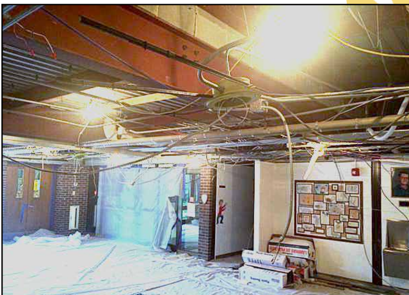
Summer Construction - This summer East View is under construction. We are completely replacing all of our hallway ceiling tiles as shown in the picture. We are also installing an additional front entrance security door in our front foyer and revamping our elevator access on the upper level. We also anticipate work to start on a paving project just off of our Spring Street entrance. The project will lead to eventual changes in student drop off and pick up and ease some of the congestion in and around the school at arrival and dismissal time.