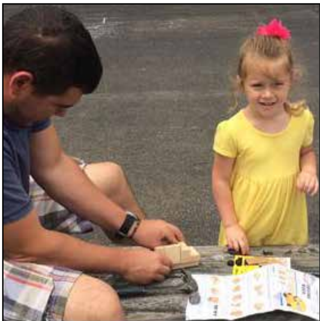
Celebrating Fathers - For Father's Day, our Pre K class invited dads and father figures alike to join their class in a celebration and a little hard work as well!