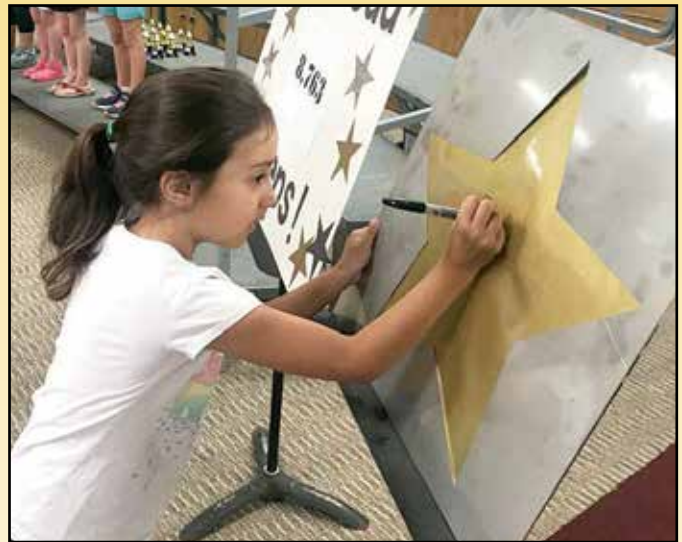
An East View student signs a “Hollywood Star” to be on the handwriting walk of fame which recognizes top students from each class and grade level.

Following is the Olean City School District mission, vision, and our guiding principles. There is nothing worse than spending people’s valuable time creating a mission and vision statement and then set it on a shelf to collect dust. The Olean City School District aspires to live and deliver the mission, vision and guiding principles every day. We ask all members of our Husky Pack to embrace the statement and principles, which will elevate both our school district and our entire community. We also encourage all to point out when we fall short of this expectation so all are held accountable. We will reflect on our progress and make adjustments as needed.