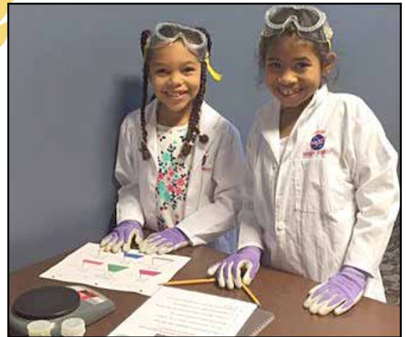
Challenger Center Visit: Our second graders visited the Challenger Learning Center and participated in the microneauts program. It was a great STEM experience.