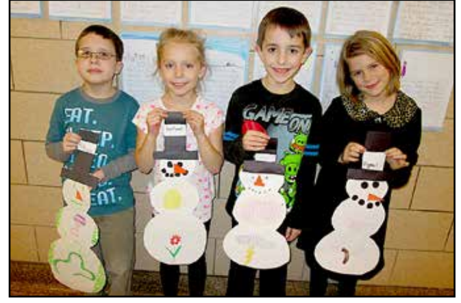
Building Compound Words: Washington West secondgraders had fun making "compound snowmen." Students brainstormed a list of compound words. They took the first part of the word and drew it in the center circle of their snowman. Then they took the last part of the word and drew it in the bottom of the snowman. Each student's compound word could be found written under their snowman's hat. Students enjoyed figuring out the compound words!