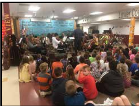
The OHS orchestra recently played for our third graders as a way to generate interest in learning an instrument in fourth grade.