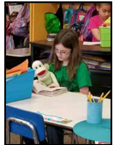
At East View, we believe reading gives you power, and the more you read the better you get and the smarter you become.