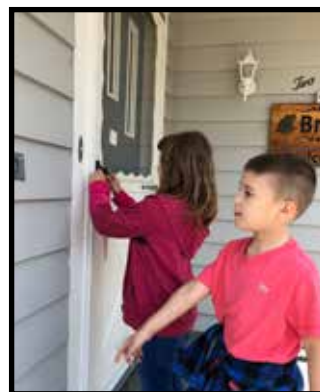
May Day: Our husky pups spent May 1 traveling to homes around Washington West delivering “May Day” baskets to Olean-area residents.

WILD About Reading: Readers of all ages were welcomed to a WILD event this month, celebrating reading and having some time to get in a few steps with our reading department. Students enjoyed games, face-painting and a ROARING good time!