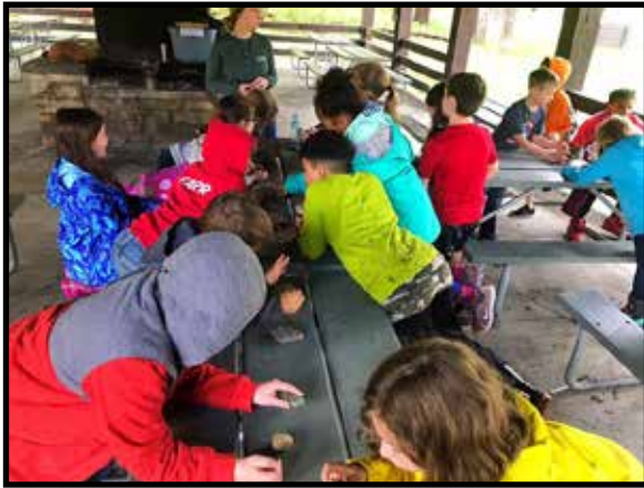
Our third graders learned about fossils during a recent field trip to Allegany State Park.