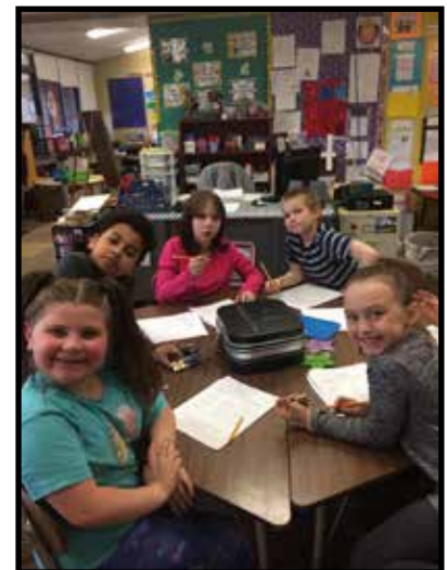
Third graders recently did a Break-OutEdu lesson.