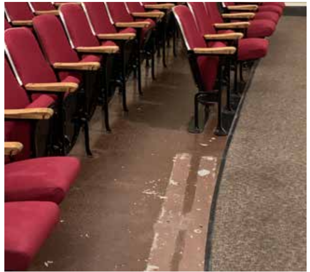
OHS | Existing Auditorium