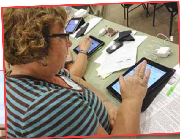
Pictured are teachers attending iPad mini camp and prepping computers for the new lab and new laptop cart at OIMS.

The District will be updating all of the wireless access points and data switches in the District during the coming months. Replacement of these pieces of equipment will make network traffic quicker for all users.